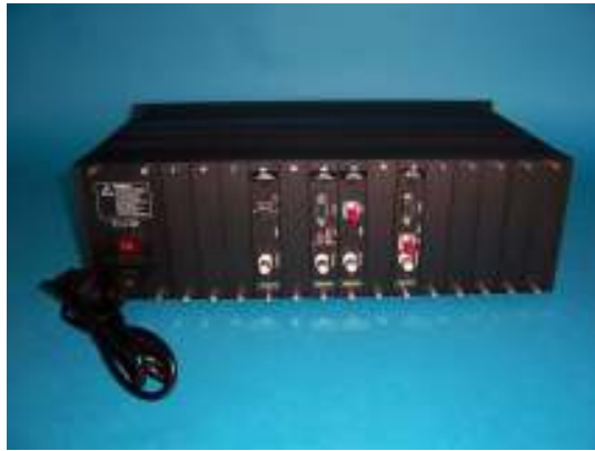
FIGURE 1: FVC14 Chassis, Rear View