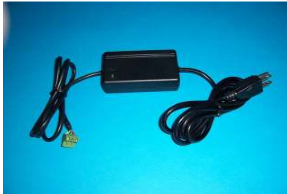
FIGURE 3: PSACV1

The PSACV1 power supply is a 120VAC to 9VDC converter used with the standalone FVT transmitters and FVR receivers. It has a 5ft., 3-conductor AC cord with grounded plug and a 3.5ft., 3-conductor DC cord with a terminal connector.