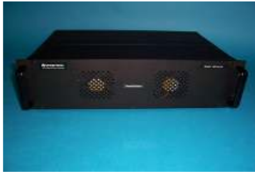
FIGURE 2: FVC14 Chassis, Front View