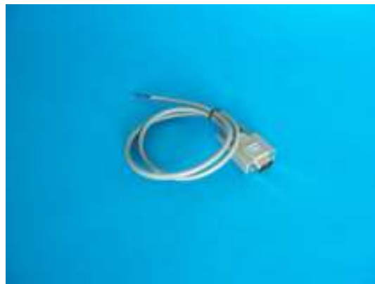
FIGURE 4: VCA1100 Data Cable

The PSACV1 power supply is a 120VAC to 9VDC converter used with the standalone FVT transmitters and FVR receivers. It has a 5ft., 3-conductor AC cord with grounded plug and a 3.5ft., 3-conductor DC cord with a terminal connector.