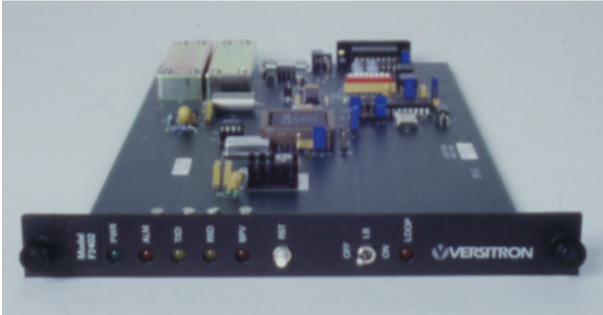
FIGURE 1. OVERALL VIEW, F2410 FIBER OPTIC MODEM